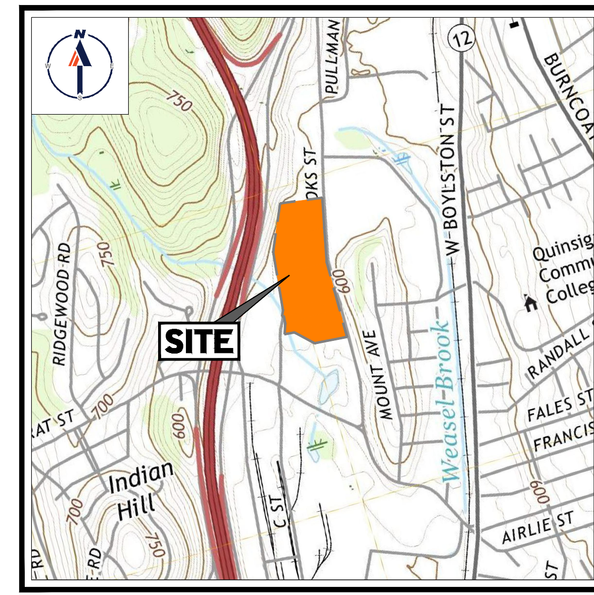
USGS TOPOGRAPHIC MAP SCALE: N/A

MAINTENANCE OF A CLEAR SIGHT LINE IS THE RESPONSIBILITY OF THE PROPERTY OWNER